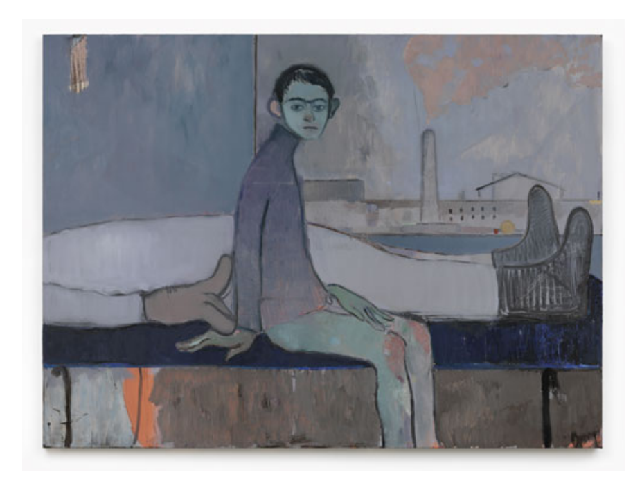
Sanya Kantarovsky, Gutted , 2016.