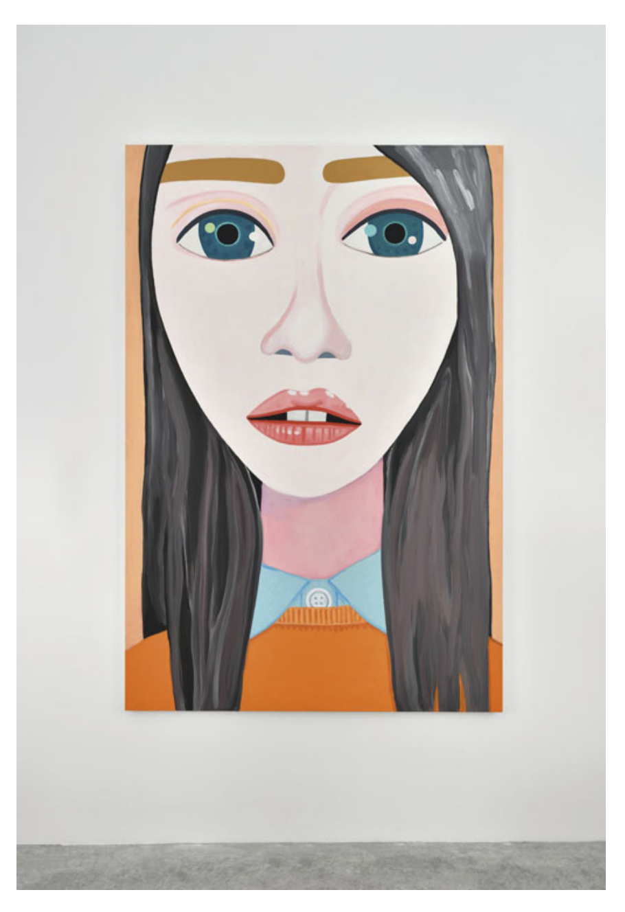
Brian Calvin, Amnesia, 2015, Almine Rech, Paris - Courtesy Artist and Almine Rech, Paris.

communicative aphasia of some coeval works appears totally surpassed by the re-appropriation of a literary and narrative language that renews itself focusing on the subject stripped of any symbolism or conceptual superstructure.