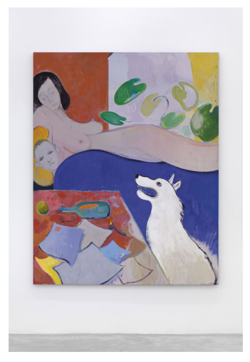
Sanya Kantarovsky, Yesterday and Today, 2014