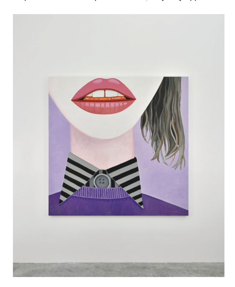
Brian Calvin, Rare Air, 2015, Almine Rech, Paris

What Calvin creates is a world inhabited by invented faces that suggest stories wrested from temporality, since he is not consequently interested in the narrative development of the artwork. For Calvin, the work lives beyond a definite sense and celebrates this emphasizing the intensity and specificity of painting with the light and realism of the traits; his figures are full of personality but deprived of passion, faces with big half-open mouths and suspended gazes that don't communicate responses but create questions. Dull, they only appear touched by a slight melancholy.