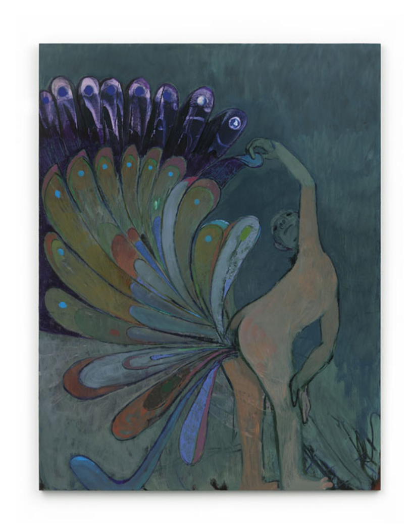
Sanya Kantarovsky, Effacement , 2016.