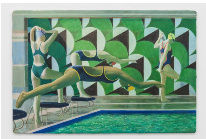
Benjamin Senior, Poolside, 2013 © The artist

classical modern, art, which is interesting, because a lot of the history of Olympic prints stems from there as well. I suppose you'd say my work's quite nostalgic – hard-edged, very formalised. That's kind of the language that I try and draw on."