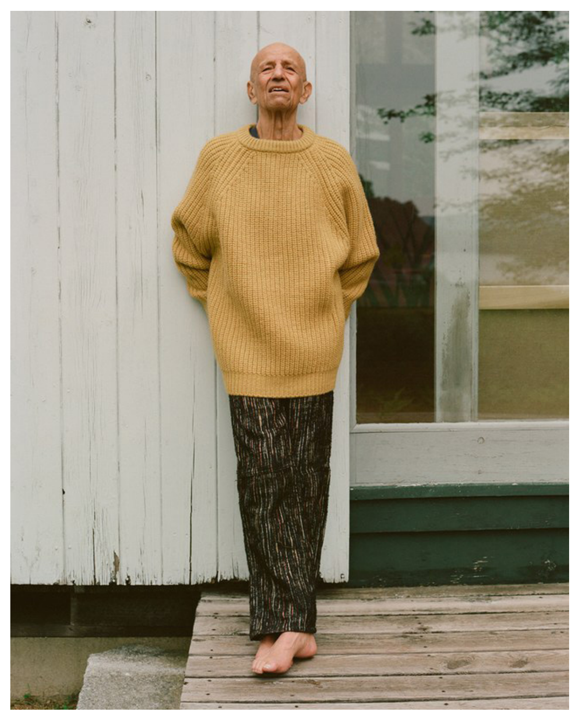
Marni blazer and pants; his own top.