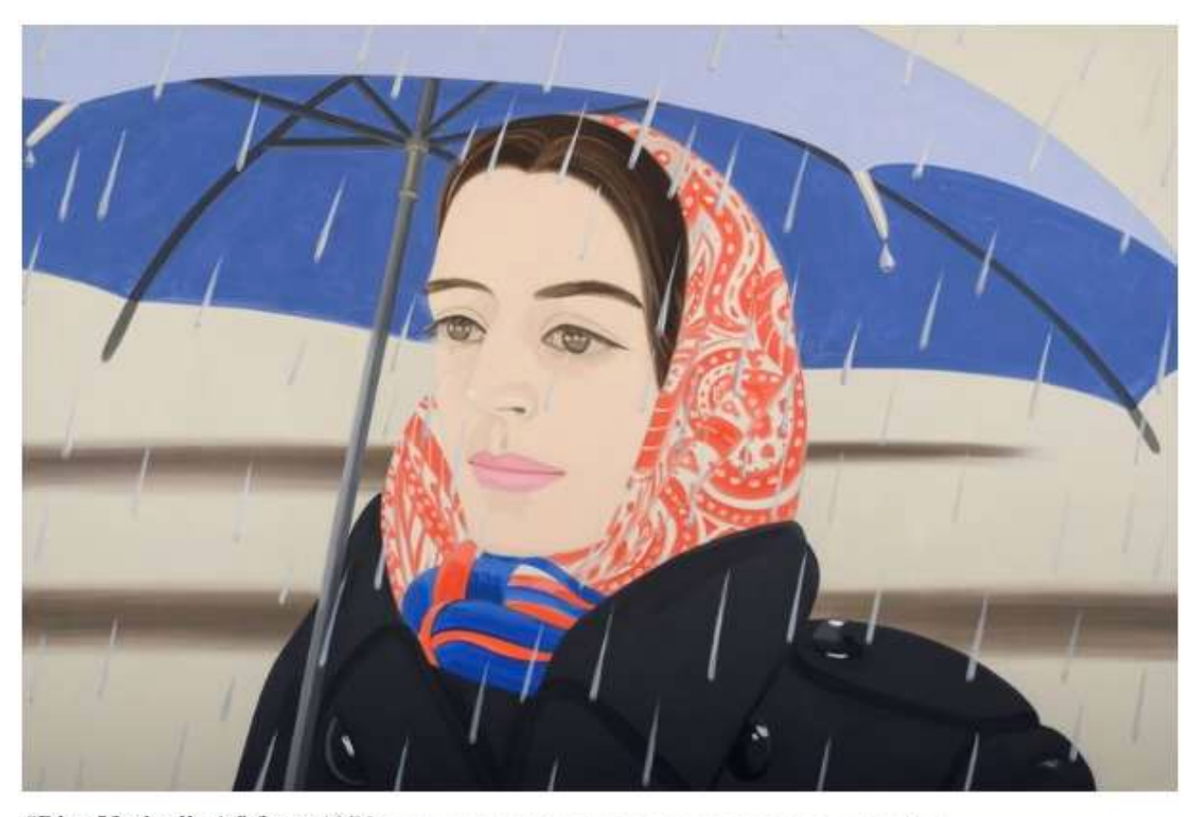
"Blue Umbrella 2," from 1972.

Horn State Park," a fully antlered bull moose turns to look at us over its right shoulder—"Just like Betty Grable," Katz suggests.