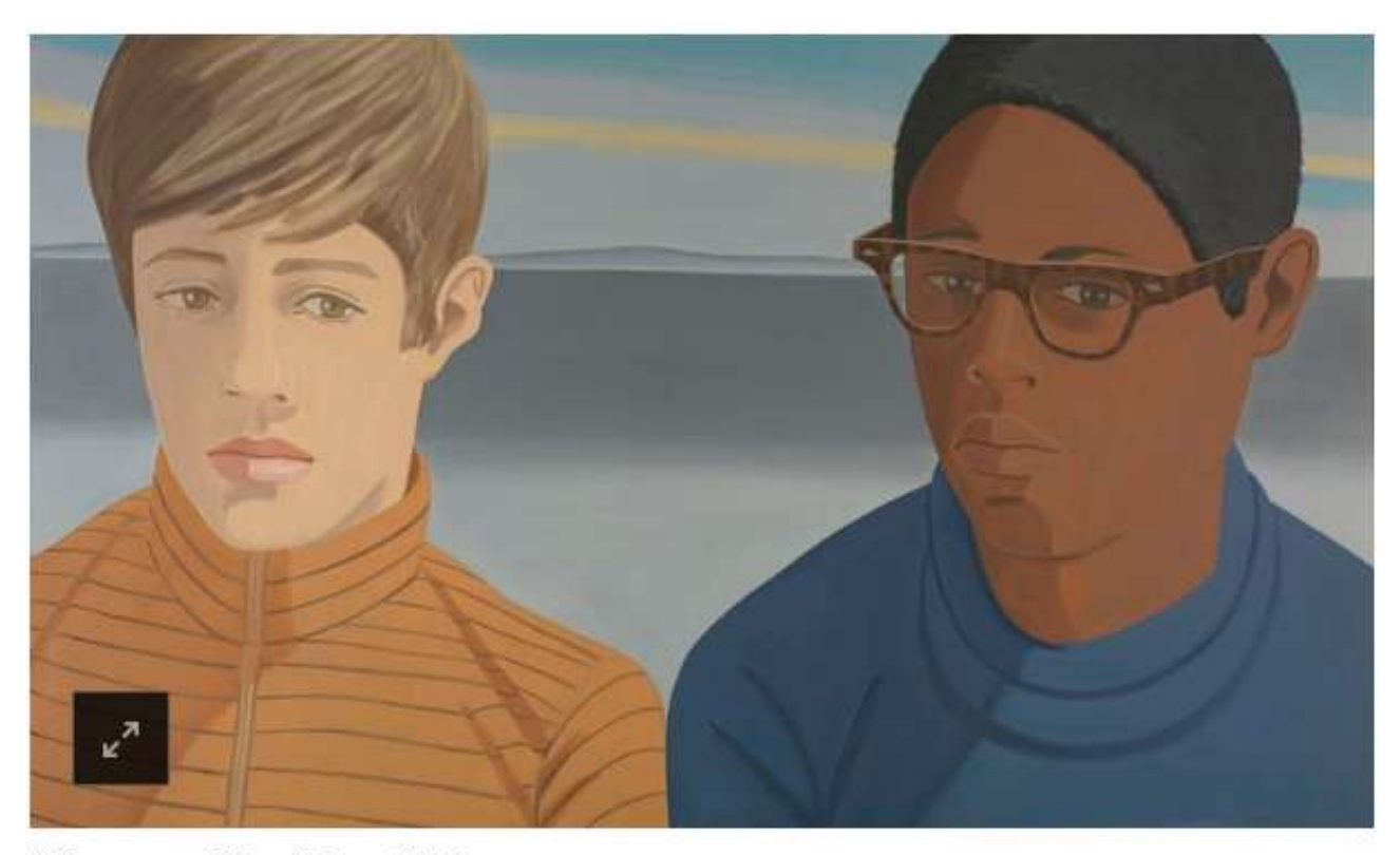
"Vincent and Tony," from 1969.

that are two coats of rabbit-skin glue on the canvas," he said. "The light goes into it, and comes back out."