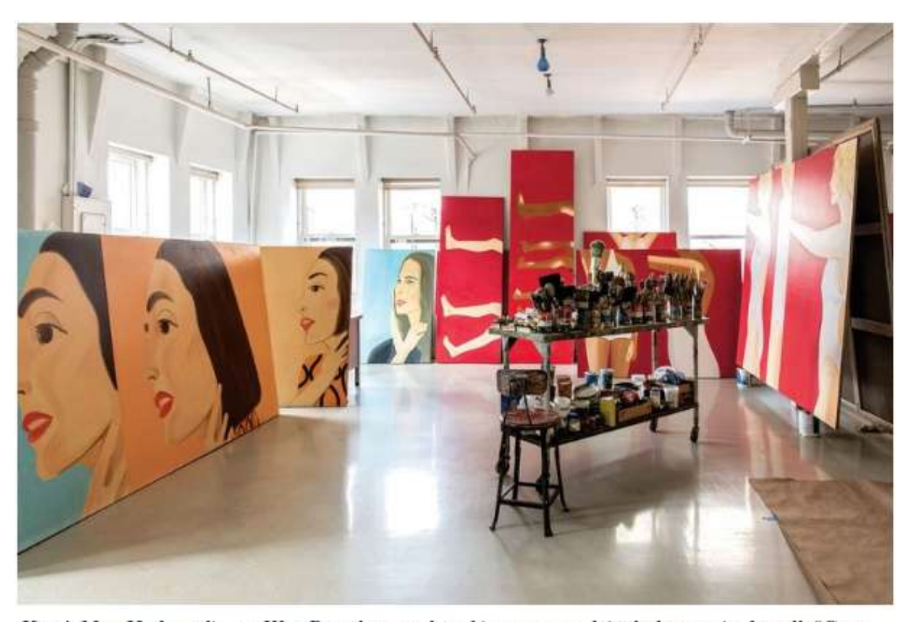
Katz's New York studio, on West Broadway, where his recent work includes a series he calls "Coca-Cola Girls" (on the right), inspired by advertising signs from the fifties.

that had fallen beyond the brown paper he'd laid on the studio's faded but immaculate linoleum floor.