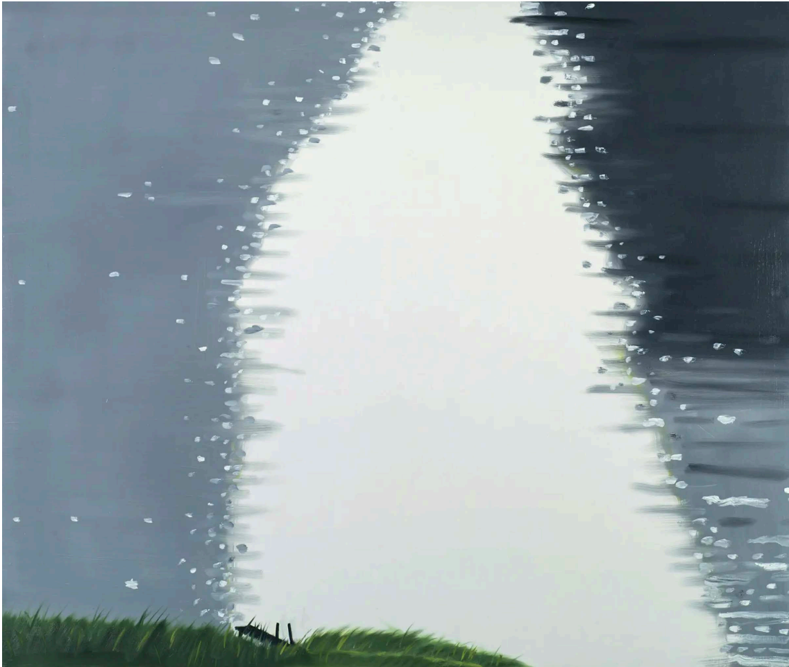
"Lake Light" (1992), a landscape of Maine, where Katz has been spending his summers painting since 1949.

interested in art," but "got somewhat pigeonholed, or had some preconceptions locked around him that don't really apply." One reason for this may be that Katz's work is difficult to categorize — "singular" is the word critics and curators often use to describe it — hovering, as it does, between realism and abstraction. He has never aligned himself with any art school or tradition, and his concerns are essentially technical and formalist (how to render an instance of perception in paint) rather than narrative or expressionist. "If I had to make a career out of ideas, I don't think that I could do anything very well," he said in 1989 in a published dialogue with the artist Francesco Clemente. "To me, ideas are subject matter and not that important ... style is important. Style and appearance." Yet an interest in something as ephemeral and evanescent as style is not today seen as the concern of a serious artist.