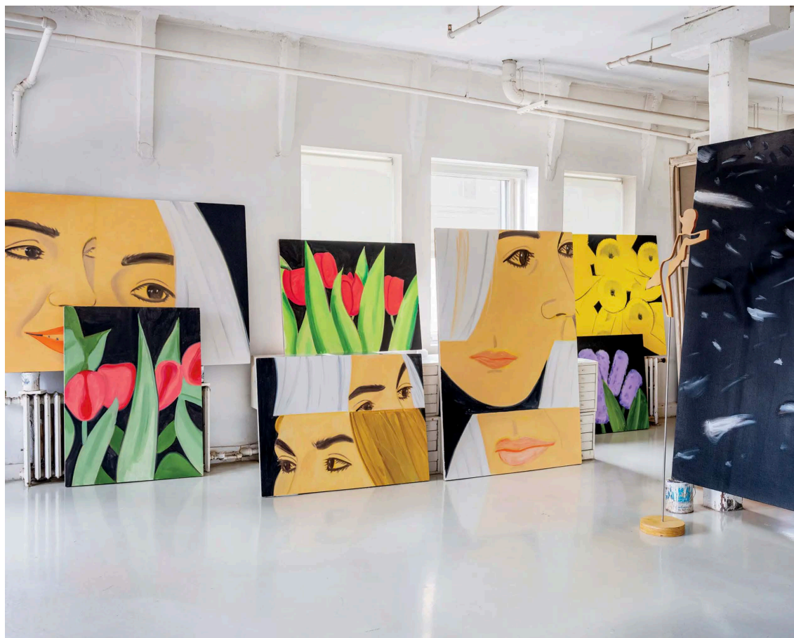
Works in Katz's SoHo studio include split portraits and flower paintings.

Katz talks like he paints — he's witty, and he cuts right to the essence of a thing. This rare and appealing quality is evident in all of his work: in the