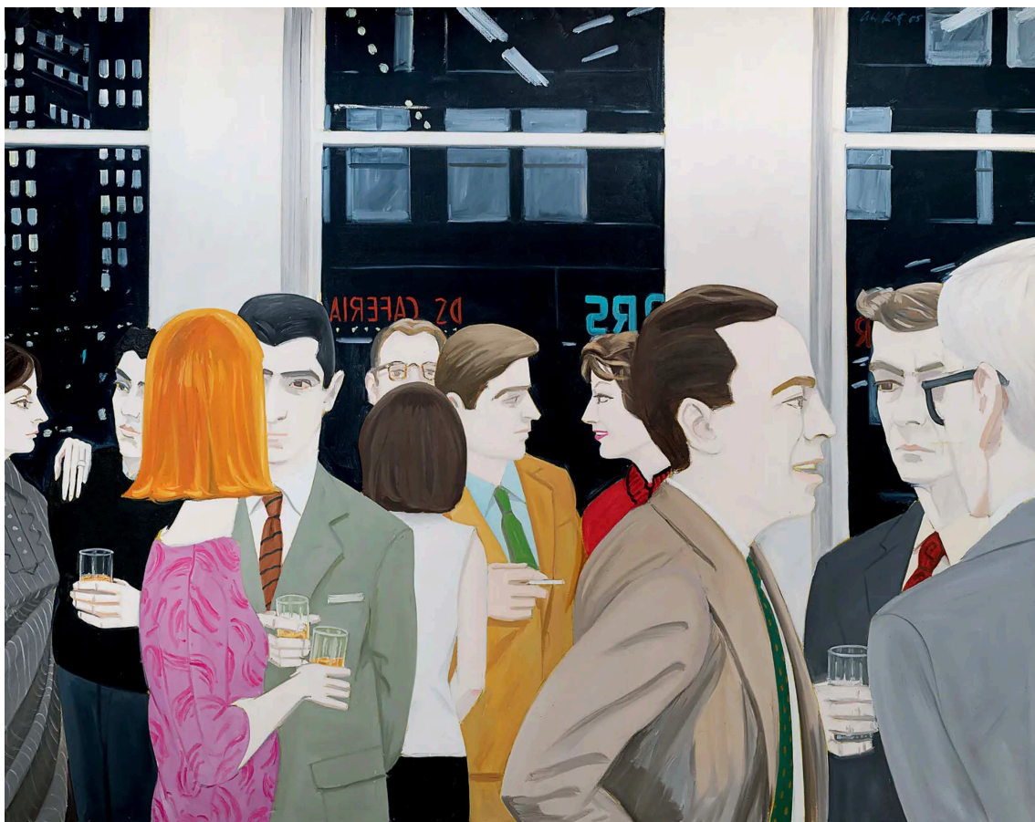
One of the artist's early group portraits, "The Cocktail Party" (1965).

tries to hook onto," he tells me, when I inquire about his antennae for what's fashionable. "It's in the air and there's a drift to it, and artists hook onto it, to varying degrees."