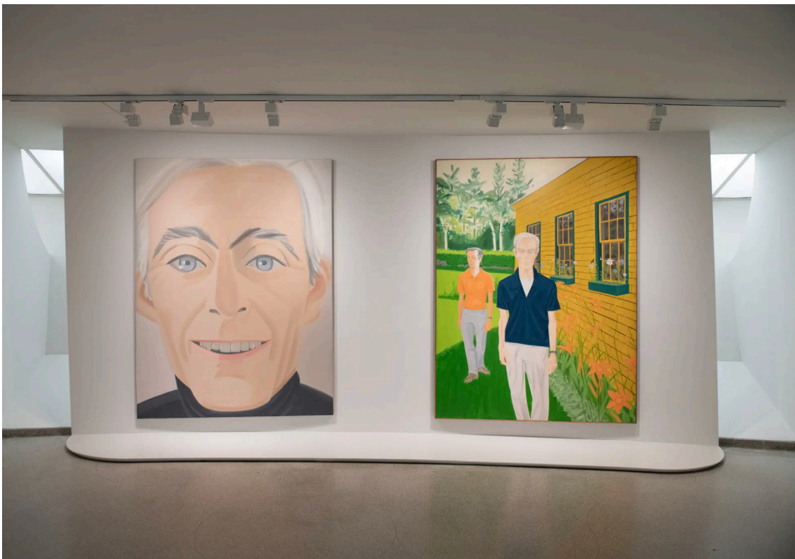
"Edwin" (1972), and "August Late Afternoon" (1973), one of Katz's many paintings inspired by his summer retreats to Maine.