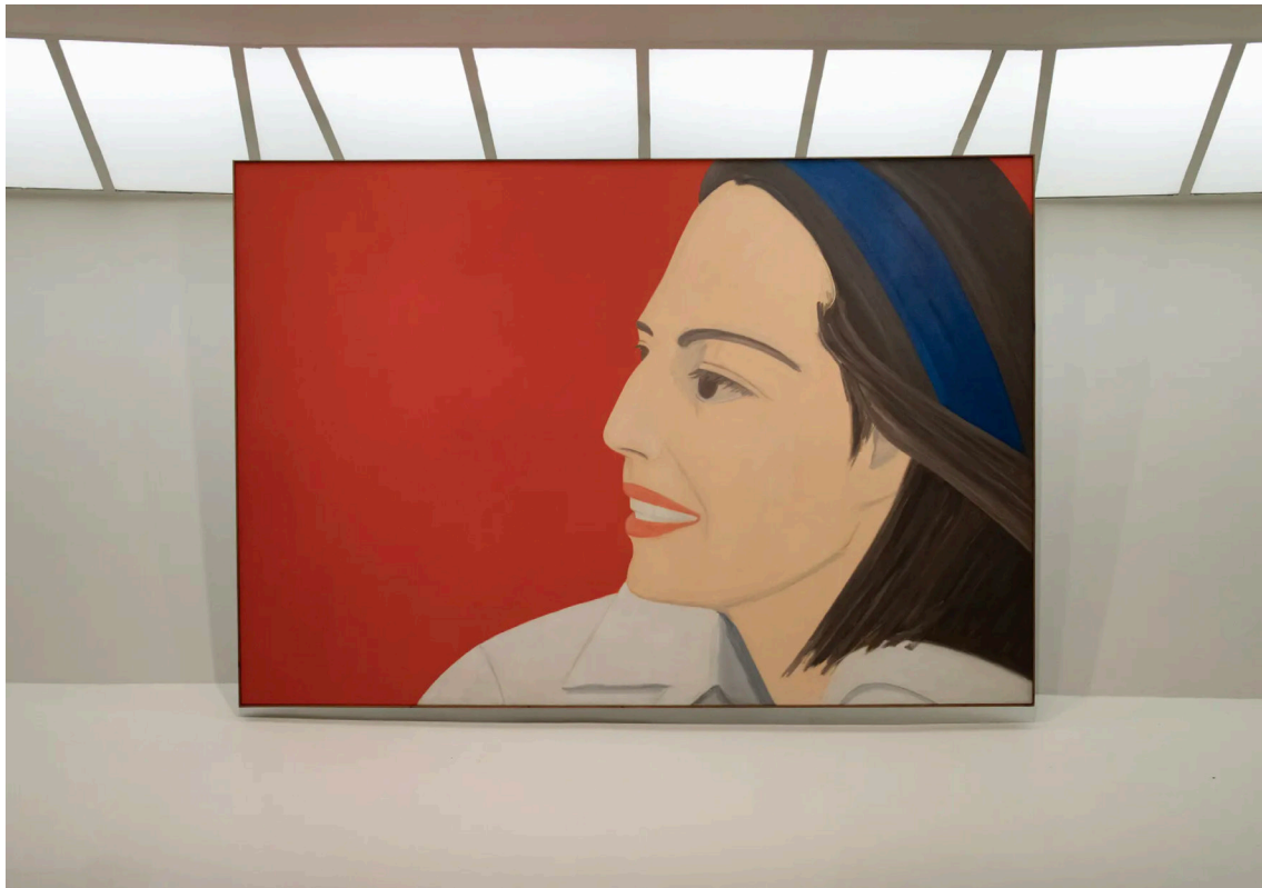
"The Red Smile," from 1963. Katz's portraits evoke the smooth aesthetics of advertising billboards and movies.