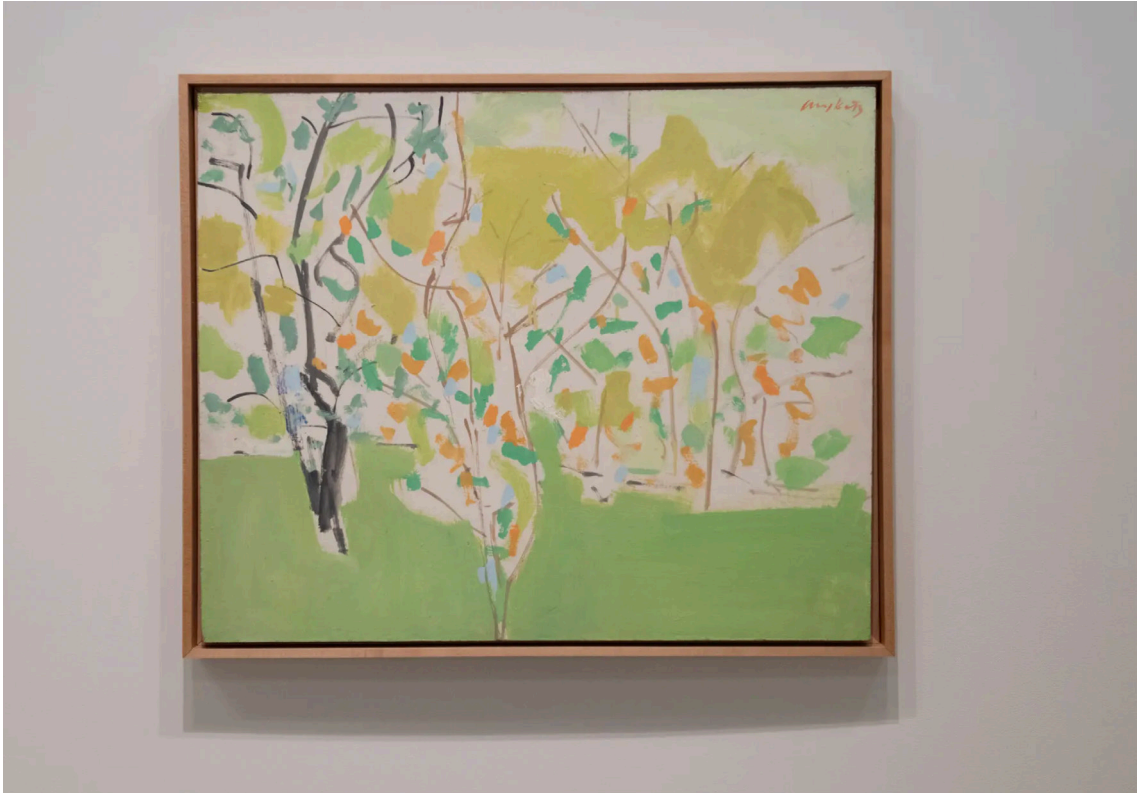
"Apple Trees" (1954), at the Guggenheim Museum, inspired by Jackson Pollock's drip paintings.