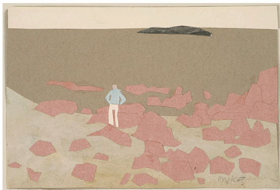
Alex Katz, "Untitled (At the Seashore)," 1958, watercolor and colored paper collage. Credit...Alex Katz/Licensed by VAGA at Artists Rights Society (ARS), NY; via Colby College Museum of Art