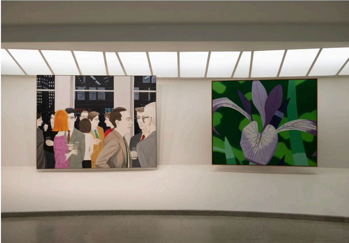
The show pairs wide-angle views, like "The Cocktail Party" (1965), with Katz's laser-focus close-ups, like the monumental "Blue Flag 4" (1967). Credit... Alex Katz/Licensed by VAGA at Artists Rights Society (ARS), NY; George Etheredge for The New York Times