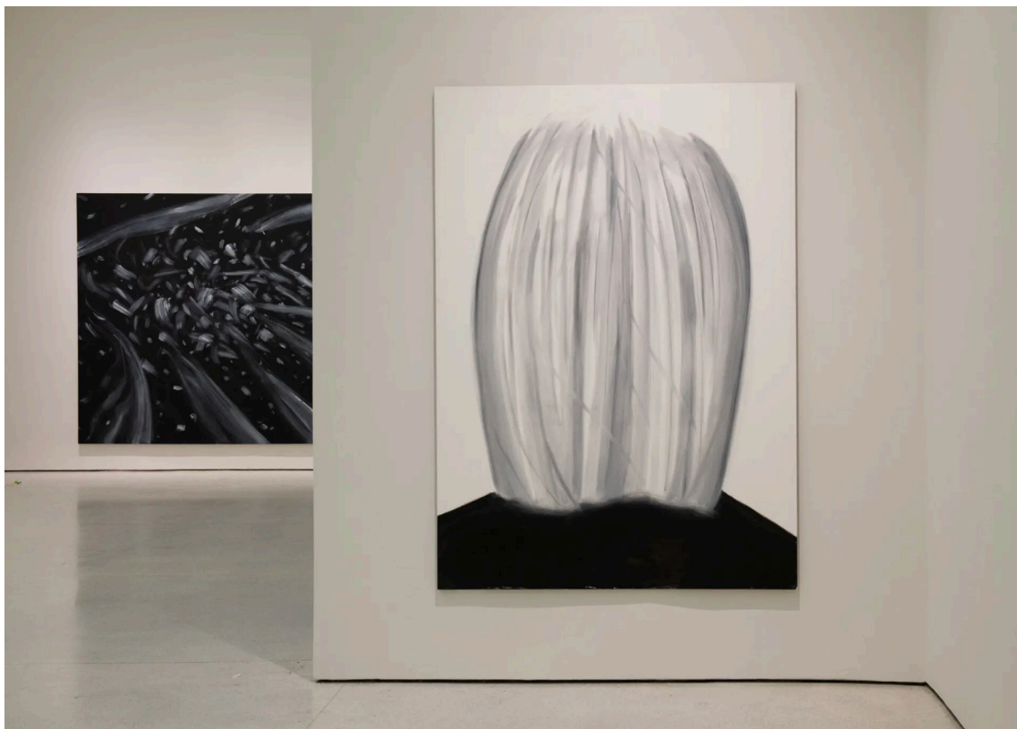
Left, "Ocean 9" (2022); right, "Ada's Back 2" (2021), showing his wife's white hair, at the exhibition at the Guggenheim, can seem tragic in bearing but sum up a joyful life lived in art.