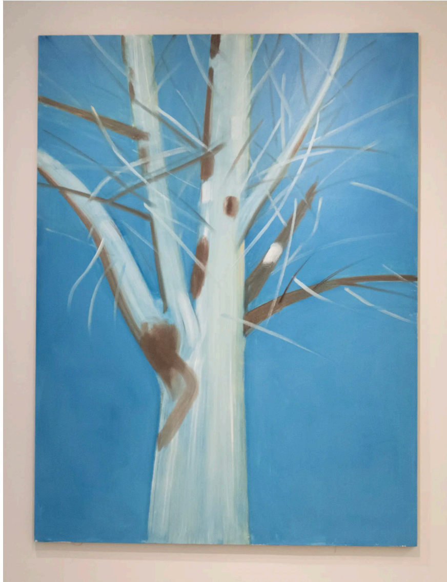
"Blue Tree 2," from 2020.