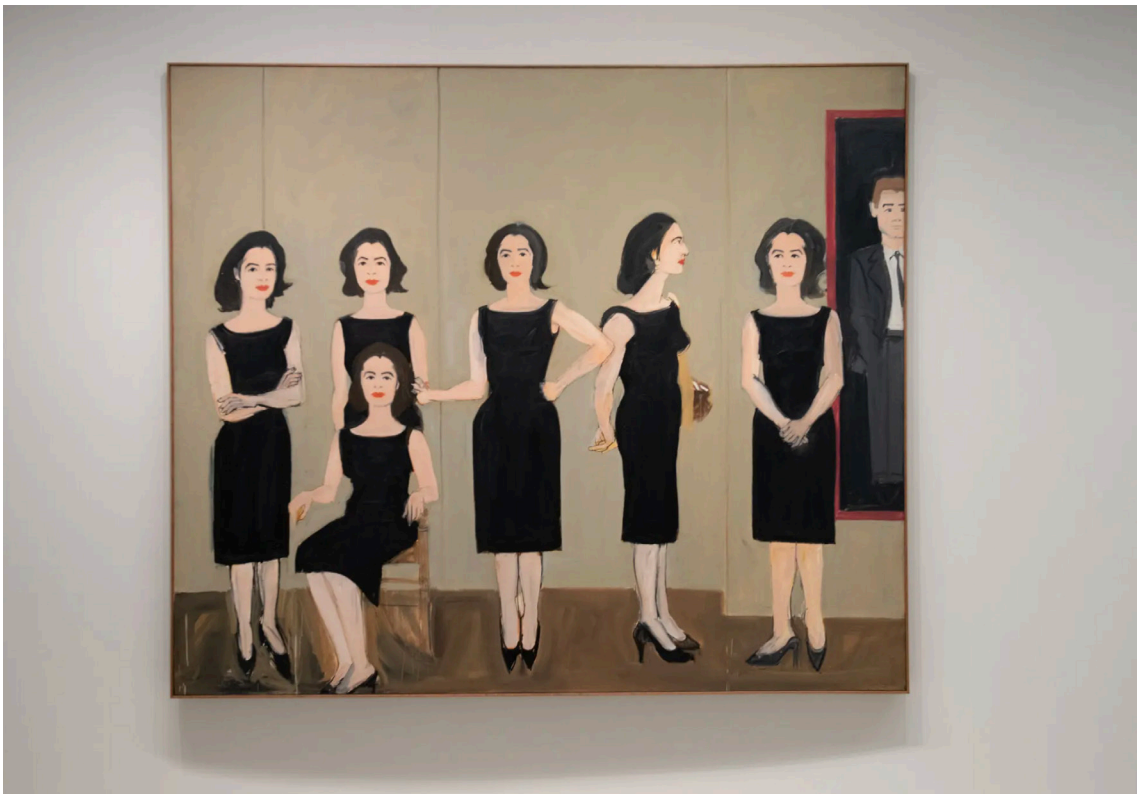
"The Black Dress" (1960), at the exhibition, 'Alex Katz: Gathering,' at the Guggenheim Museum.