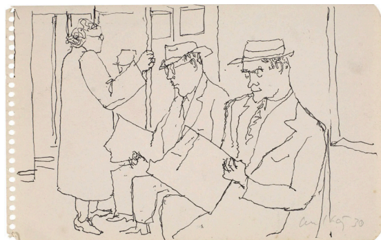
Alex Katz, "Untitled, from Subway Series," ca. 1946-1949, pen on paper.