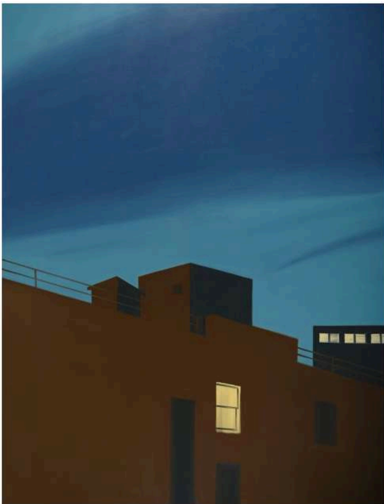
"SoHo Morning," from 1987.