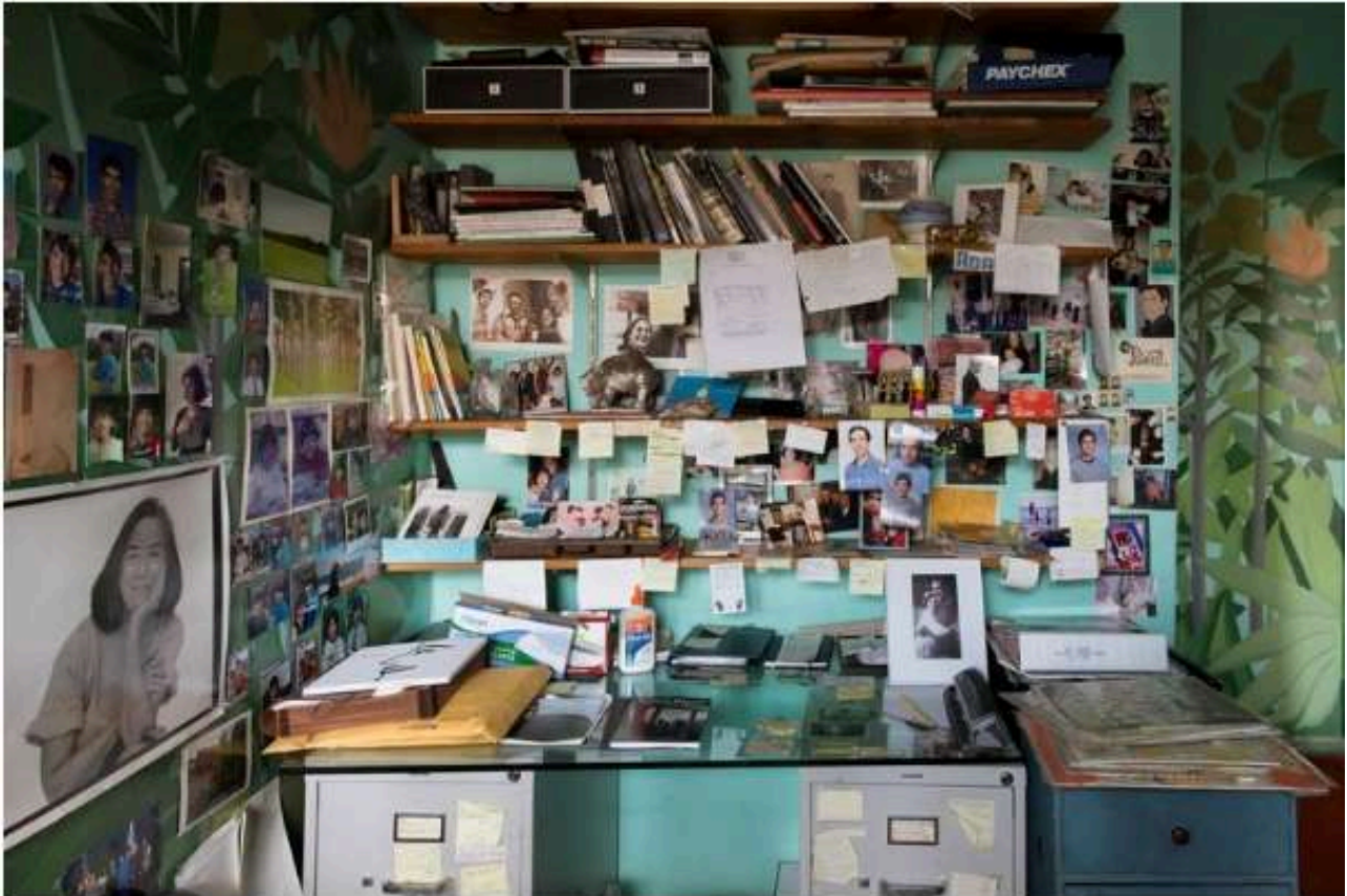
An office in Alex Katz's studio, filled with photos of his family.