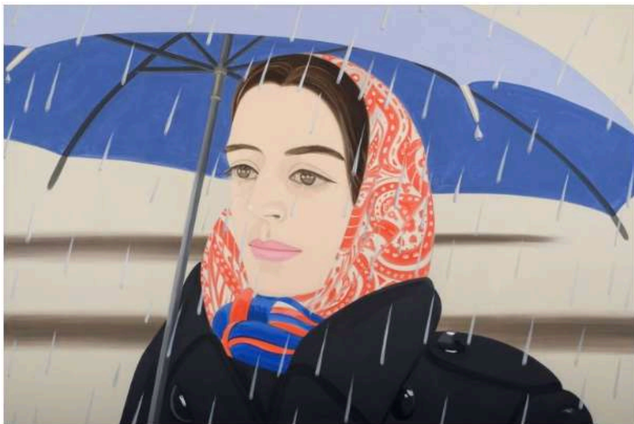
"Blue Umbrella 2," from 1972.

Horn State Park,” a fully antlered bull moose turns to look at us over its right shoulder—“Just like Betty Grable,” Katz suggests.