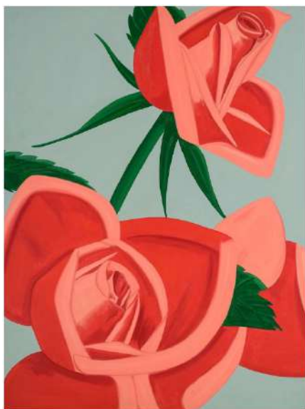
"Rose Bud," from 1967.

other New York poets. “They liked my paintings and I liked their poetry,” he said. O’Hara reviewed Katz’s work favorably in ARTnews and elsewhere, and bought two of his paintings in 1960. “I think Katz is one of the most interesting painters in America,” O’Hara wrote. “He has the stubbornness of the ‘great American tradition’ in the dominating face of European influences.” O’Hara was in Katz’s studio at four o’clock one morning, telling him what to do, Katz recalled. “I said, ‘Listen, Frank, I know how good I am,’ and he said, ‘Don’t get porky with me. You’re the one who’s going to have to hang near Matisse.’” Katz’s career might have taken a different path if O’Hara, who became an assistant curator at the Museum of Modern Art in 1960, hadn’t died in 1966—he was hit by a beach buggy one night on Fire Island.