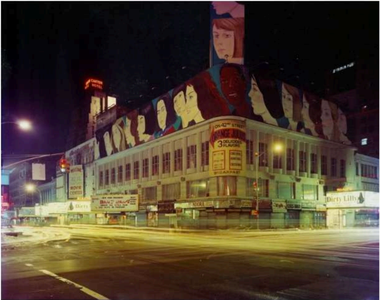
“Times Square Mural,” from 1977.