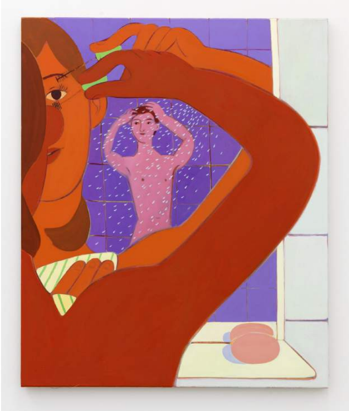
Grace Weaver, Sunday brunch w/bb , 2015