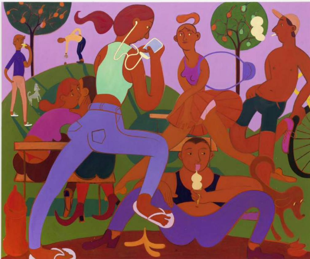
Grace Weaver, Lust for lite , 2014